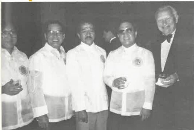
Fellows visiting U.S.A. attend the Banquet.