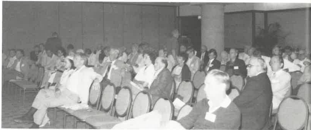
Sessions fill early to hear outstanding discussions.

Here again, the wives and families are invited to attend all the lectures as the entire family needs to be part of the dental team and take an active interest in the practice.