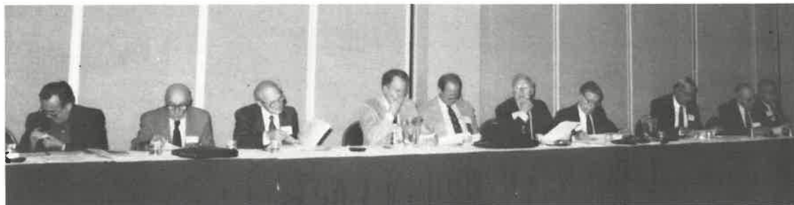
Board of Regents at work in San Francisco, 1985.