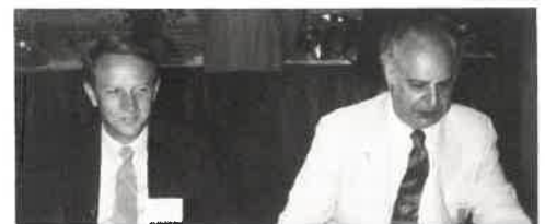
West Virginia Fellows at Chapter meeting.

The Chapter agreed to participate in a joint breakfast with the American College at the Semi-annual meeting of the West Virginia Dental Association in Wheeling in