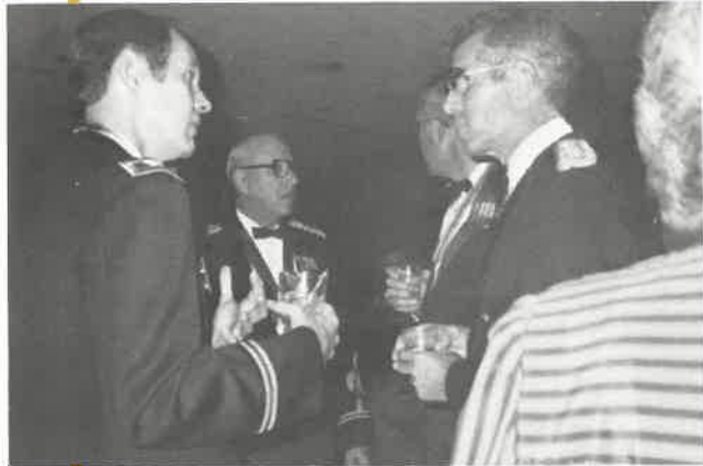
Service Fellows visit at Social Hour prior to the Banquet.