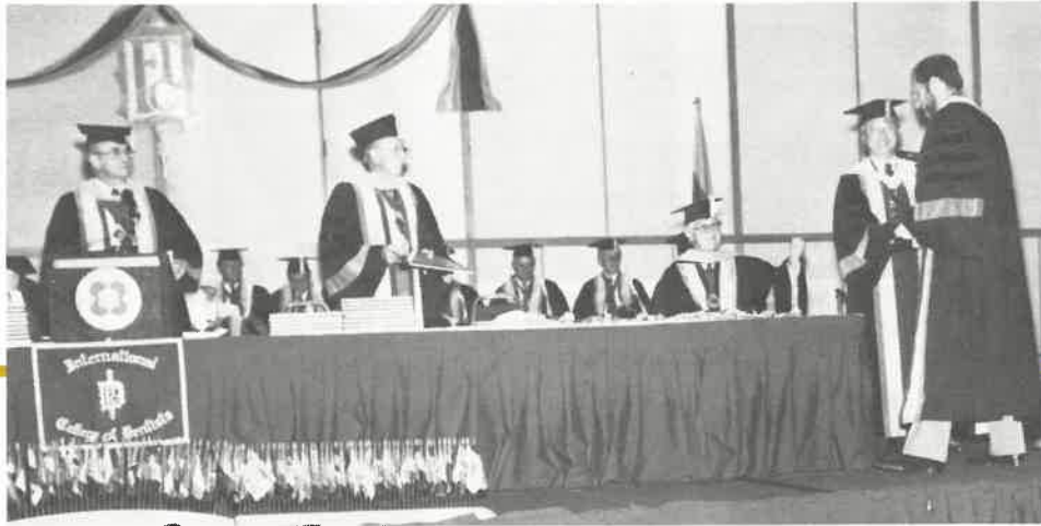
Presentation of the Key and Certificate at 1985 Convocation.