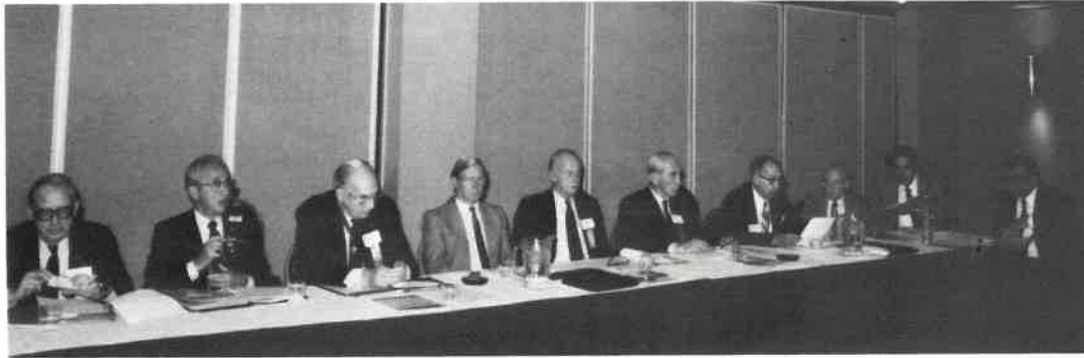
Executive Council of the I.C.D. in session in San Francisco.